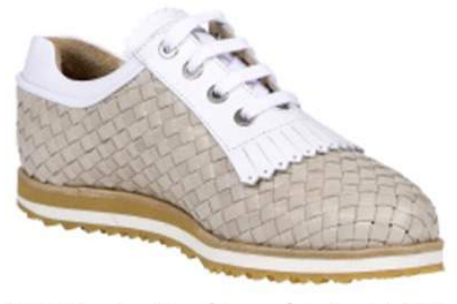
ARCO - Ladies shoe - beige/white

With their anatomical longitudinal arch support in the footbed, which prevents fatigue of the foot, they allow you a carefree and successful game on the golf courses of this world A large selection of colours and designs is available in combination with your golf outfit. AerogreeN ladies golf shoes are available in EU sizes from 36-42, and also in half sizes.