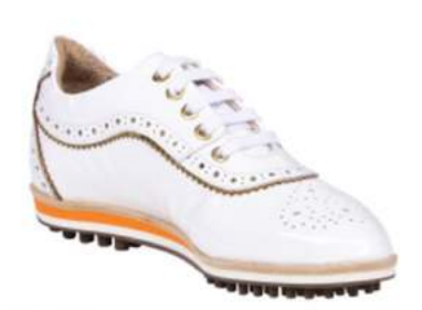
POSITANO - Ladies shoe - white patent/gold