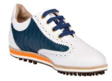
PRATO - Ladies shoe - white/crocoprint med blue