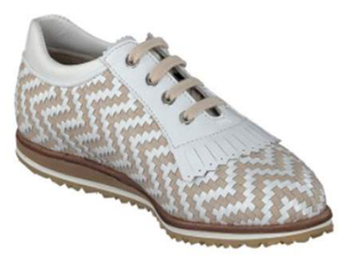
BELLAGIO - Ladies shoe - beige/white