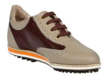
PRATO - Ladies shoe - beige/Lizardprint brown patent