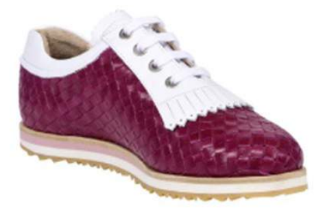
ARCO - Ladies shoe - wine/white