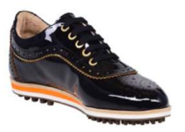
POSITANO - Ladies shoe - black patent/gold