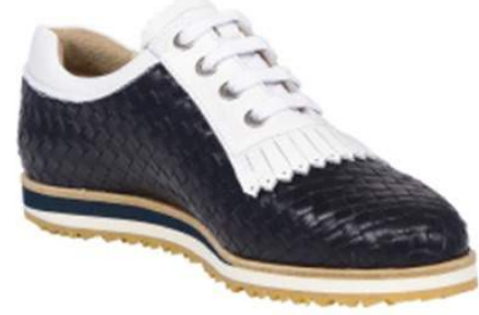
ARCO - Ladies shoe - navy blue/white